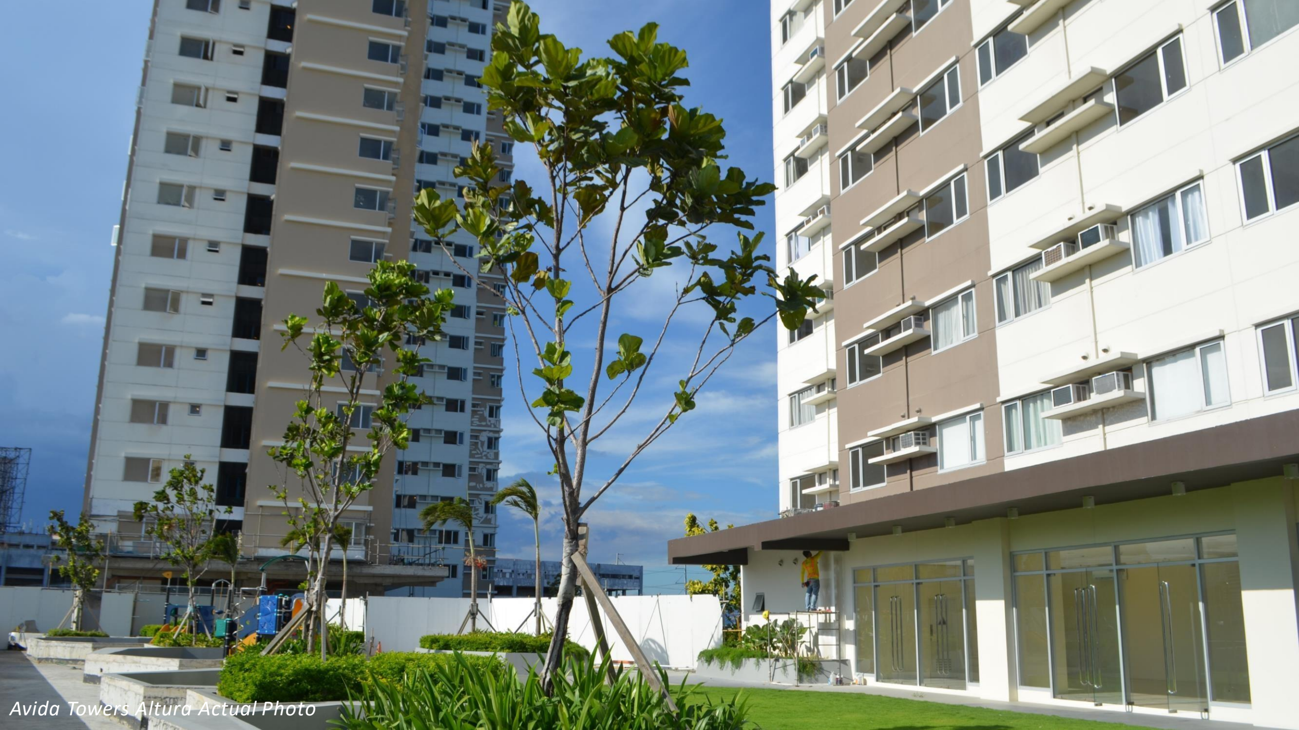
Avida Towers Altura Actual Photo